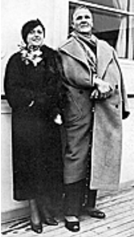
On shipboard with Chaliapin