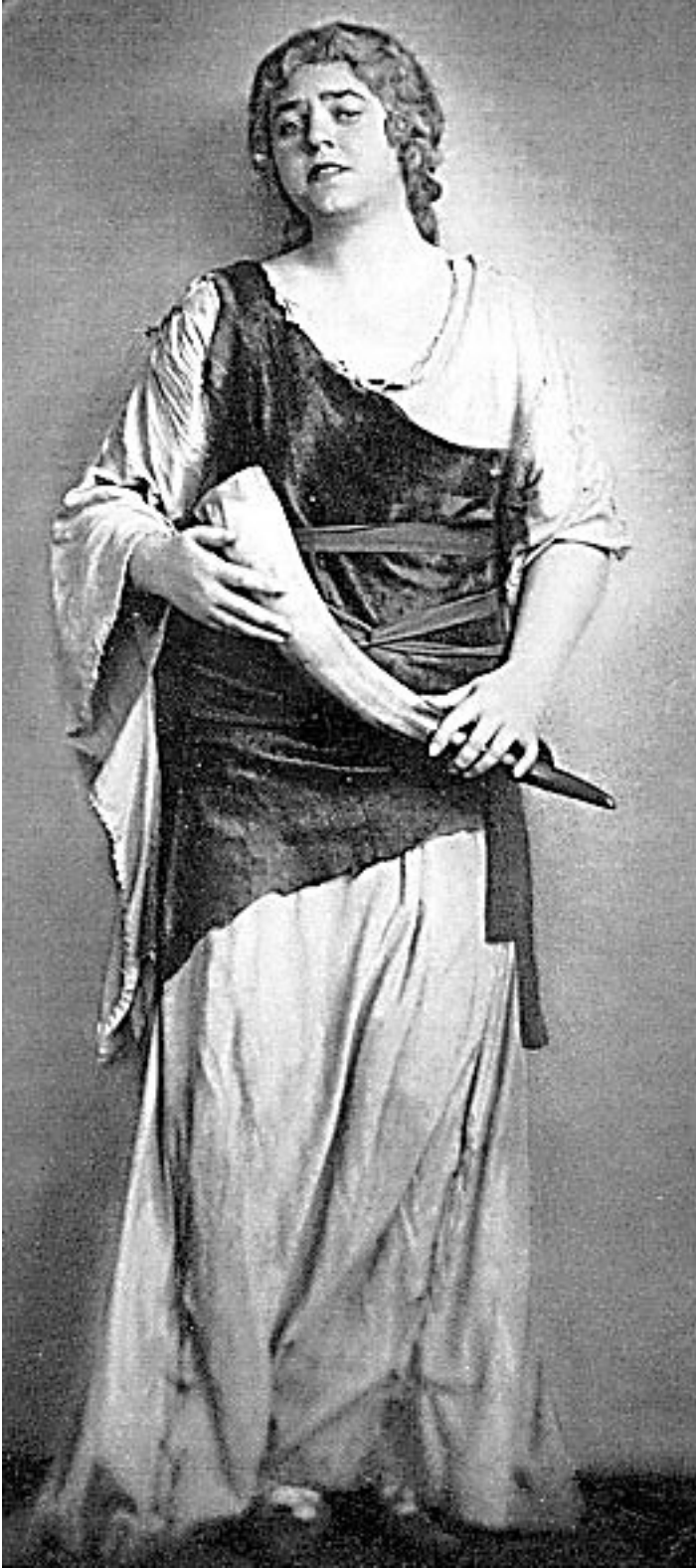
Frida Leider, Brünnhilde; Lauritz Melchior, Siegmund; Friedrich Schorr, Wotan; Norman Allin, Hunding; Bruno Walter, cond., Covent Garden, London