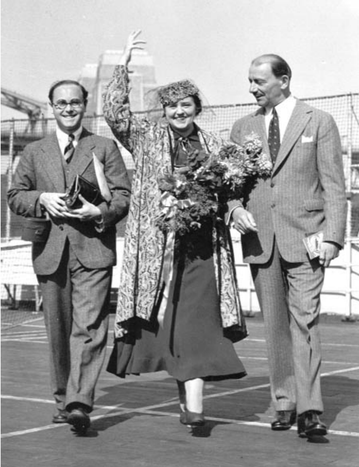
with PU and Otto