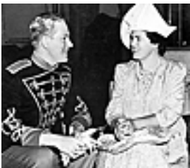
with Nelson Eddy