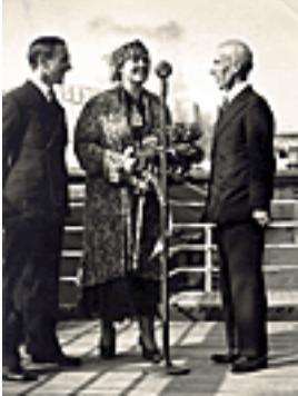
on board ship