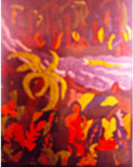
Some of LL's art work