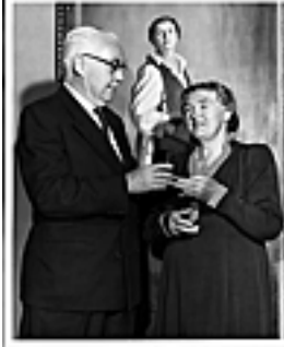
Leonore portrait behind

“Lotte Lehmann Day” proclaimed in Santa Barbara