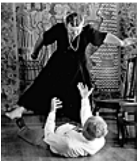
demo at MAW